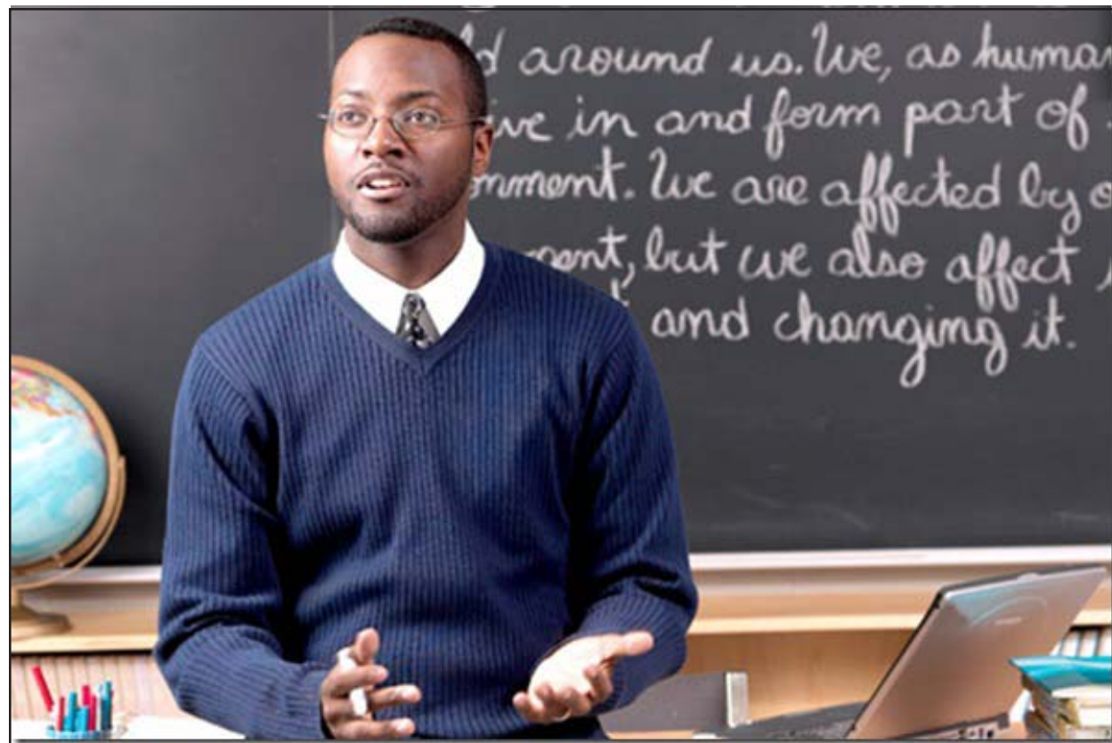
The annual teacher recruitment fair of the Oklahoma City Public School System will be held earlier this year than previously.