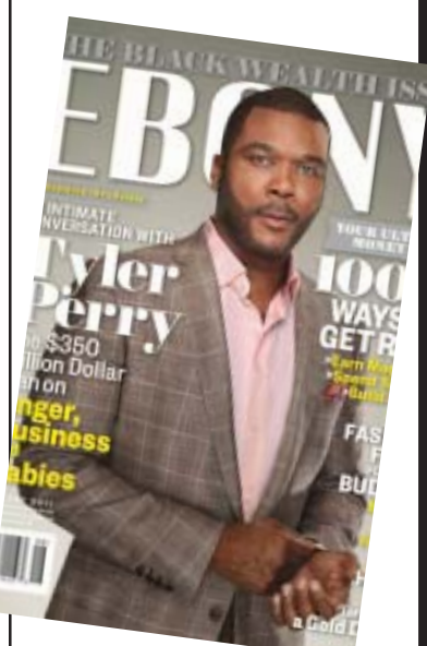
The town of Forest Park is among towns and cities in the nation mentioned in the latest edition of Ebony magazine as having a concentration of wealthy Blacks as residents.