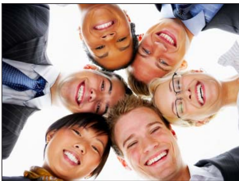
Health and wellness programs will be central to the offerings of a new center to be built in northeast Oklahoma City.

Agency will provide health and longevity activities for the elderly.