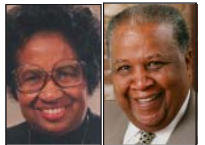
Clara S. Luper

The famed rights leader, a retired history teacher, was inducted into the Oklahoma and the Oklahoma Afro-American Halls