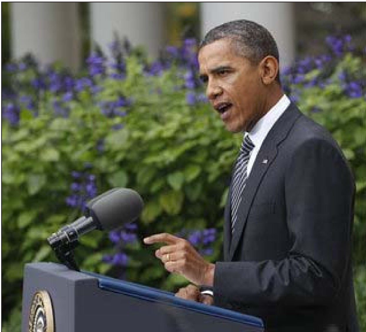
"We've demonstrated what collective action can achieve in the 21 st Century," President Barack Obama said as he spoke at the White House on Thursday about the death of Col Moammar Gadhafi, the Libyan dictator.