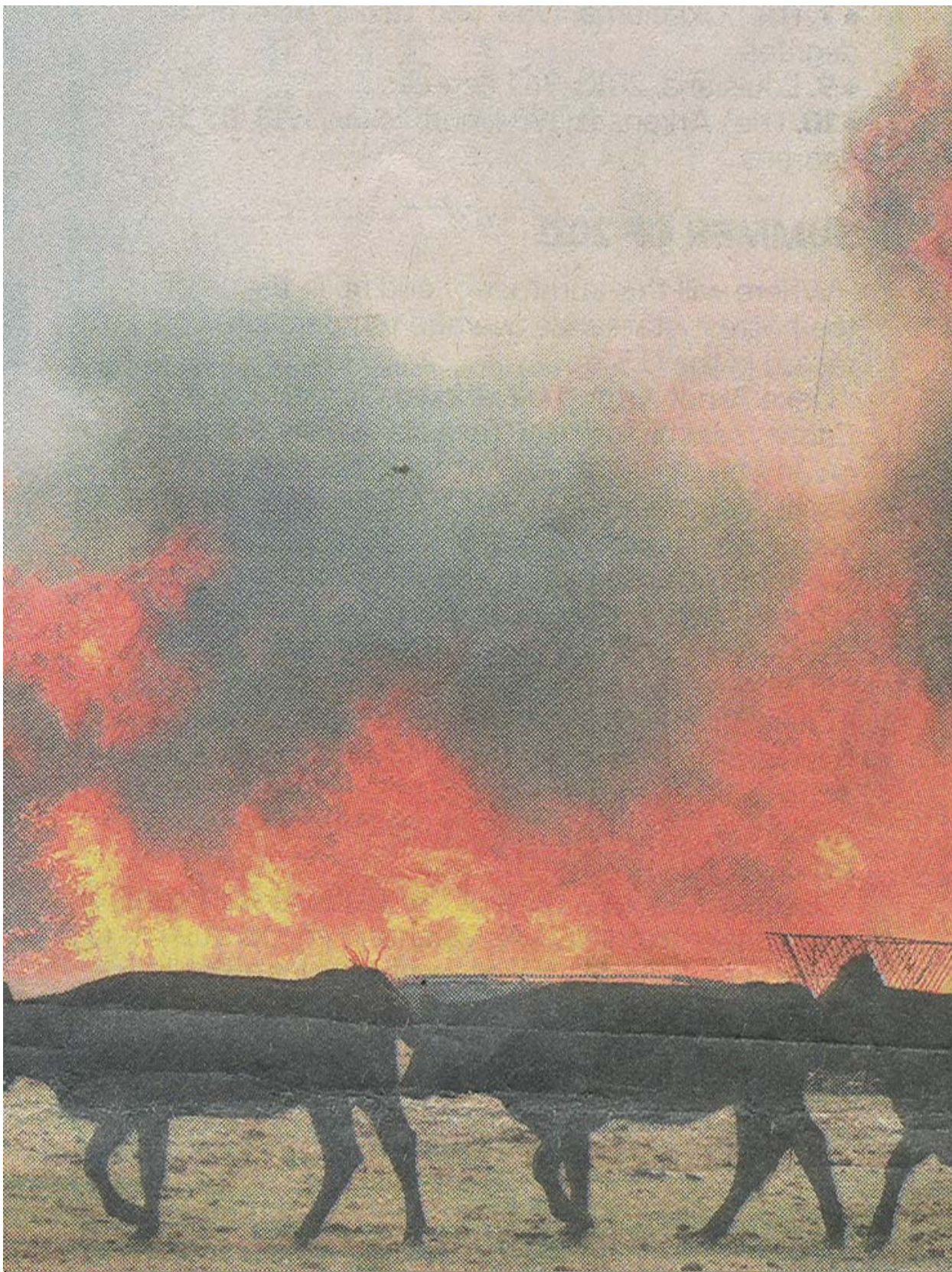
The wildfire set tall cedar trees ablaze, burning down a number of homes and other structures, and causing the evacuation of residents and livestock.

Long yellow grass had caught fire, and "lit up large cedar trees that burned like giant torches," The Oklahoman reported.